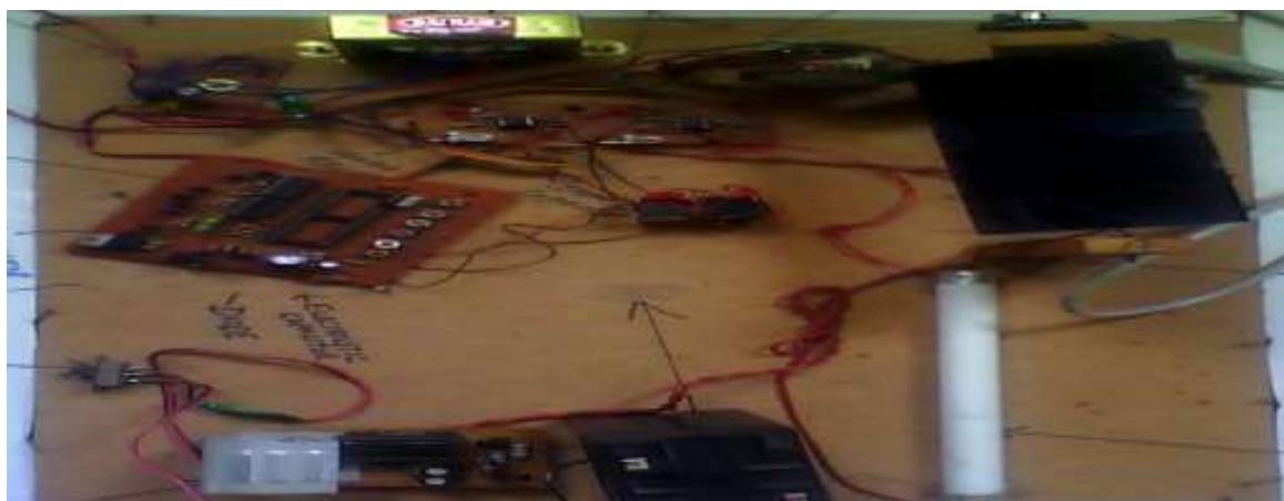
Fig.2. A schematic view of the solar tracker

Since the working model of the Microcontroller based solar tracker is mainly concern with the embedded software control, the Microcontroller (AT89C51) is the heart of this model. The Microcontroller selected for this model had to be able to convert the analog photocell voltage into digital values and also provide four output channels to control motor rotation. The detailed circuitry of Microcontroller based solar tracker is shown in Fig. 2.